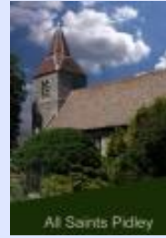
All Saints Pidley