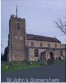
St John's Somersham